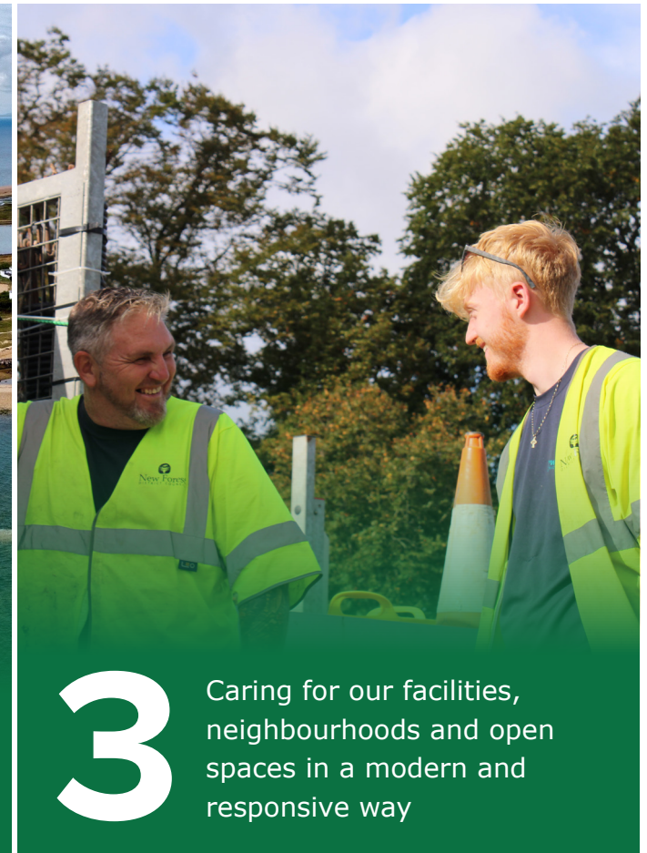
Out on location carrying out essential work