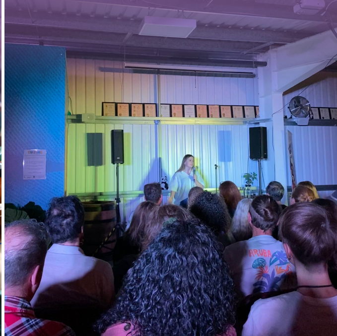
Comedy night in partnership with Culture in Common

Empowering our residents to live healthy, connected and fulfilling lives