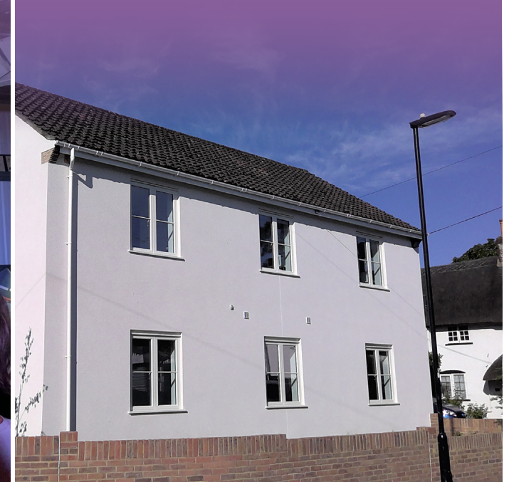
One of our housing developments, Platinum House, Ringwood