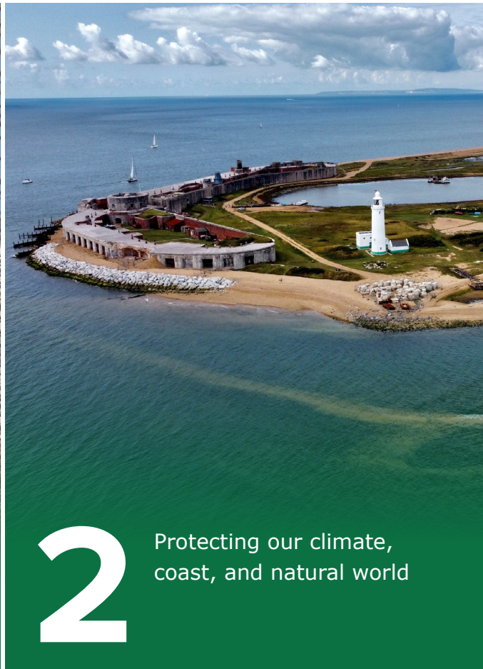
Aerial view of Hurst Spit