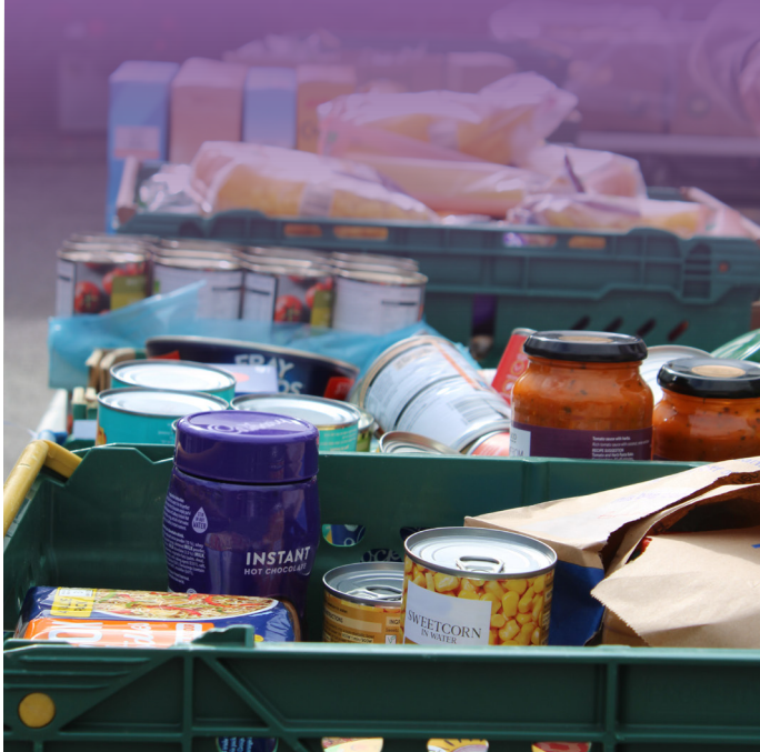
One of our 5 food larders

Helping those in our community with the greatest need