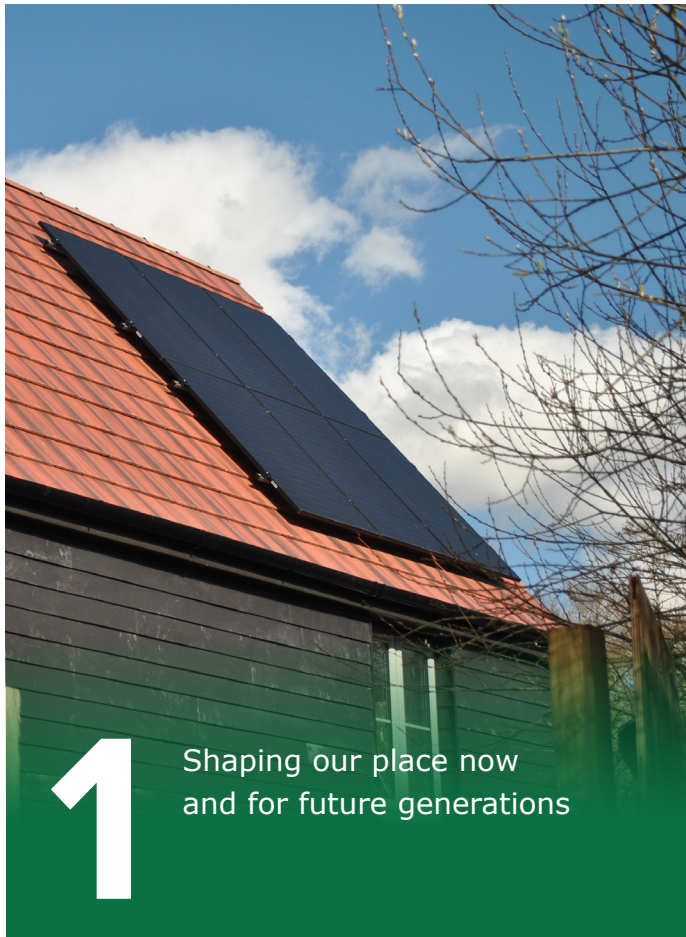
Our Ladycross housing development, Hythe